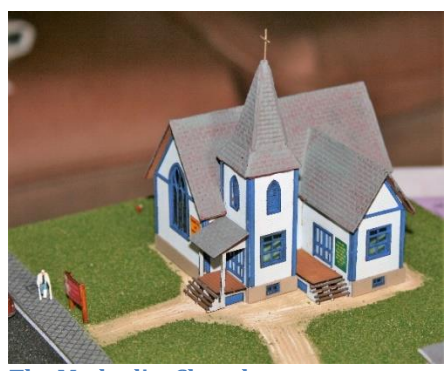
The Methodist Chapel

Digging around on the hard drive I found some pictures of past models of mine to share. All are kit built.