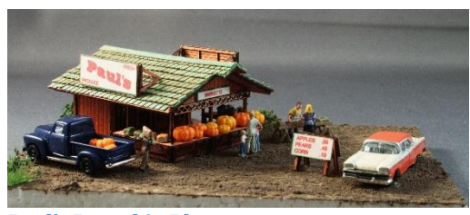
Paul's Pumpkin Place