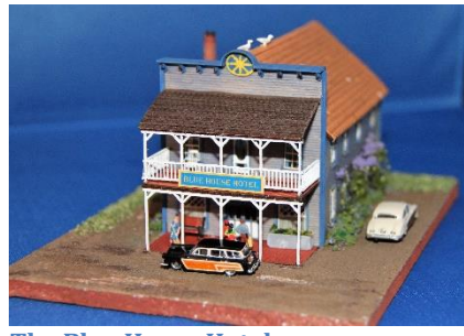
The Blue House Hotel