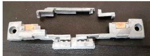
Attempt to repair frames before final collapse

being held in place by gravity and the body shell!