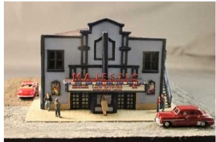
The Majestic Cinema